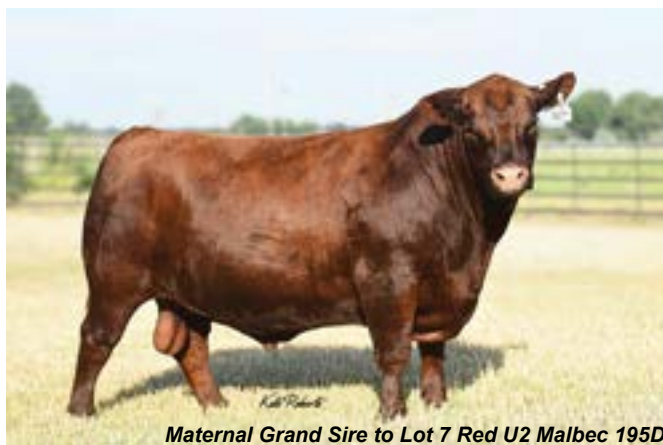
Maternal Grand Sire to Lot 7 Red U2 Malbec 195D

Grace 220K is a super fancy dark red May show prospect. She will make a great project for a junior show family and has all the backing to be an excellent cow after that.