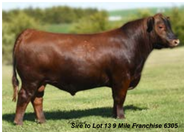
Sire to Lot 13 9 Mile Franchise 6305

This stout January heifer offers quiet the sporty look. She offers a dark red color, great depth, squared hips, and a smooth stride. We grow more fond of her dam continuously. And her sire is known for his calving ease. This heifer would be a great addition to your herd or your show string.