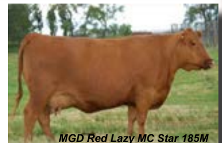
MGD Red Lazy MC Star 185M