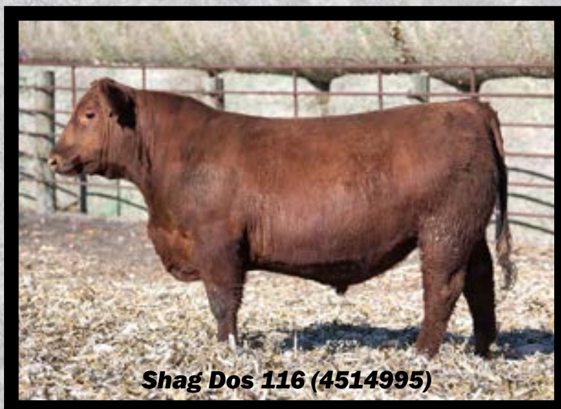
Shag Dos 116 (4514995)

9 Traits in the top 7% of the breed or better!