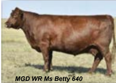
MGD WR Ms Betty 640

The youngest of our 5 Wideload 78B sired fall bred 0J13's dam is the result of embryos purchased in the Weidenbach dispersal, she is a big bellied, feminine, and attractive cow prospect. Her MGD, 640, has a long track record of producing success including the 2010 National Champion Ms Betty 9035 and the 2014 NWSS Champion Pen of Three heifers. This much mass, bone and near perfect feet with her heritage is rare and one to latch on to! AI'd 12/24/22 to the popular Genex sire, Crump New Decade 9341 (4099482) PE 12/30/22 to 1/31/23, to LSF SRR EZ Factor 9056G (4110072) our resident calving ease, carcass specialist and a high selling herd bull in the Ludvigson dispersal, pictured on the IFC of this catalog then to VETO Journeyman (4526895) 1/32/23 to 3/1/23 a WFL Merlin 018A x LSF Saga bred natural born son of our signature female Feddes Lakina D6, who's a long bodied, dark red 2 year old. Resulting calf will need to be DNA sire verified depending on birthdate, ultrasound results available sale day. Ultrasound 48 days bred on 2/8/23.