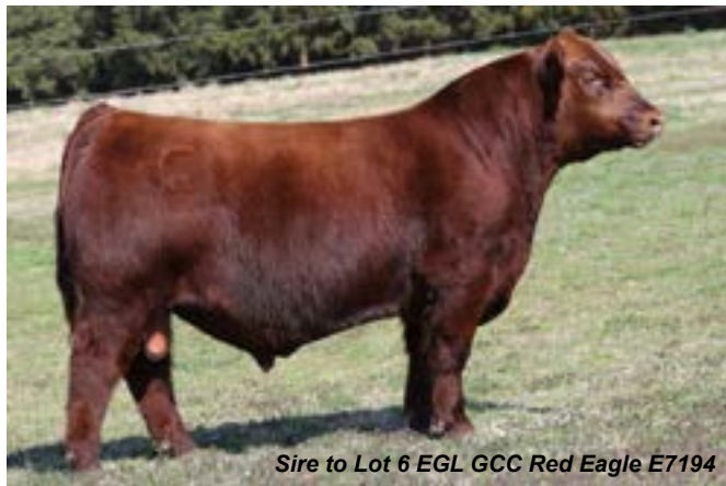
Sire to Lot 6 EGL GCC Red Eagle E7194

This daughter of the 2018 Dixie National and KY State Fair Champion Female and the popular Red Eagle Bull is one you don't want to miss out on. She is very eye appealing with plenty of depth and spring of rib. She is just a May and I think she will be very competitive in that summer division.