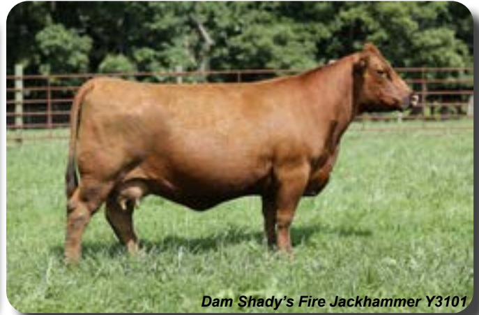
Dam Shady's Fire Jackhammer Y3101