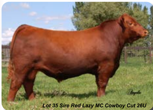
Lot 35 Sire Red Lazy MC Cowboy Cut 26U

Bull calf at side WDSC Red Eagle K3 (4710163) Sired by EGL GCC Red Eagle, Born 11/7/2022 Pasture Exposed to WDSC Sailors' Delight (4638841)