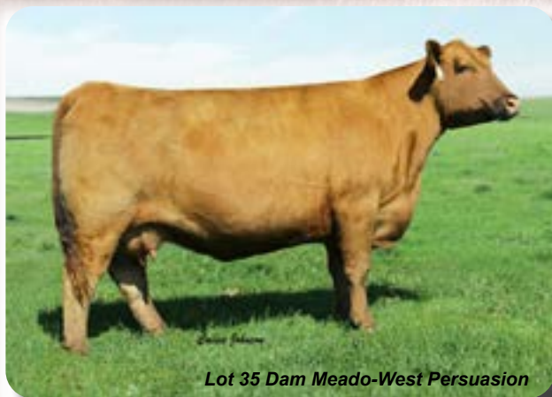
Lot 35 Dam Meado-West Persuasion