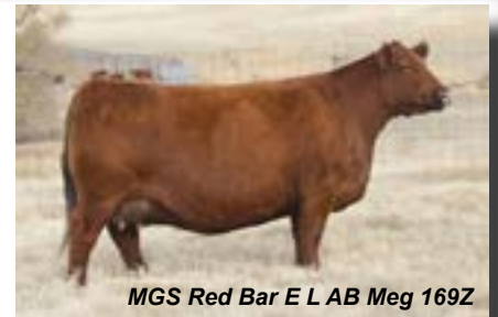
MGS Red Bar E L AB Meg 169Z