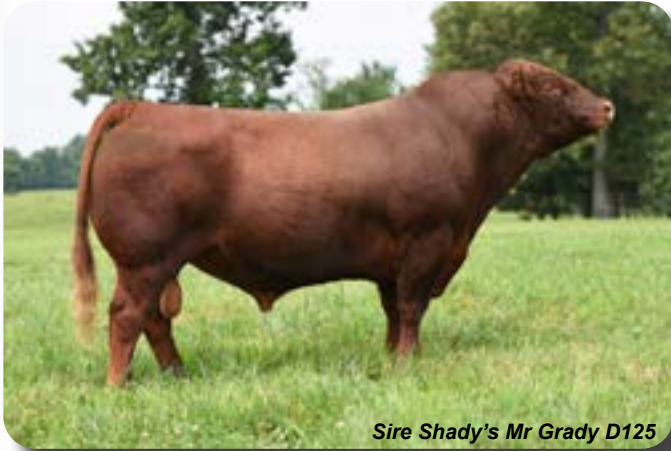
Sire Shady's Mr Grady D125