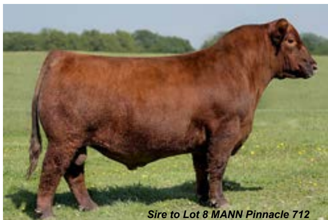
Sire to Lot 8 MANN Pinnacle 712

KJHT PINNY 2260 brings a lot of quality to the table She is sound, balanced and when you really look at this heifer you can't help but appreciate her width and dimension. If you are looking for a unique breeding piece to add to your program this heifer will not disappoint.