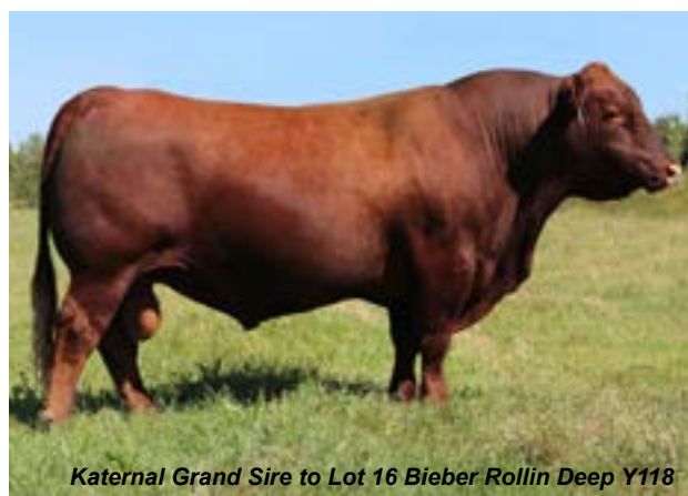
Katernal Grand Sire to Lot 16 Bieber Rollin Deep Y118

Yes, he's only a fall bull calf, but if you're looking for some great genetics in a bull you can develop in your system, study this one. His dam is a full sister to WEBR Reform. You're getting a powerhouse pedigree with great cows on the top and bottom.