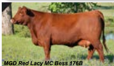
MGD Red Lacy MC Bess 176B

919J is the first of our 5 paternal sisters sired by the popular and proven ST Genetics sire Pelton Wideload 78B, the paternal brother to the rare and deceased MANN Red Box 75C from a 108 MPPA dam and a grandson of the famed Meado West Persuasion. 78B has been our go-to sire for making deep bodied, thick and feminine females with near perfect udders. We have several in the cowherd so we feel comfortable in offering these fall breds from nationally known grandams and families. 919 in her first three generations brings such greats as Meado West Persuasion, Star 185M and Bess 2S (the dam of the great Lazy MC Detour) Her dam, 109F, is the result of a flush purchased from BCR Ventures, TX from their top donor, 176B. We have 2 of her full sisters in the VVF herd, another flush sister was a top selling lot as our guest consignment to the Whitley's 2018 "Share the Herd" sale. 919 has the trademark look you expect from her elite heritage in a moderate, deep bodied, feminine package. APE 12/27/22 - 1/31/23 to LSF SRR EZ Factor 9056G (4110072) our resident calving ease, carcass specialist and a high selling herd bull in the Ludvigson dispersal, pictured on the IFC of this catalog, then to VETO Journeyman (4526895) 1/31/23 to 3/1/23 a WFL Merlin 018A x LSF Saga 1040Y bred son of our signature female Feddes Lakina D6, who's a long bodied, dark red 2 year old. Resulting calf will need to be DNA sire verified depending on birthdate, ultrasound results available sale day.