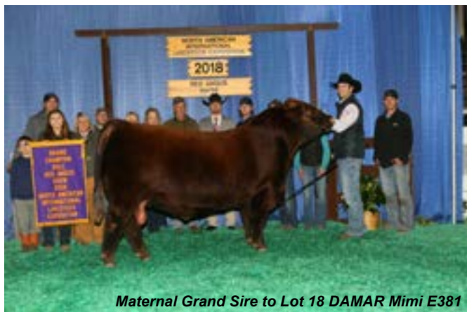
Maternal Grand Sire to Lot 18 DAMAR Mimi E381

If you're looking for a herd sire that will give you top quality replacement heifers and plenty of pounds on your steer calves then Kickstart your herd with this son of EGL Red Eagle.