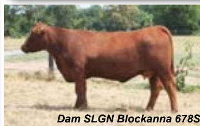
Dam SLGN Blockanna 678S