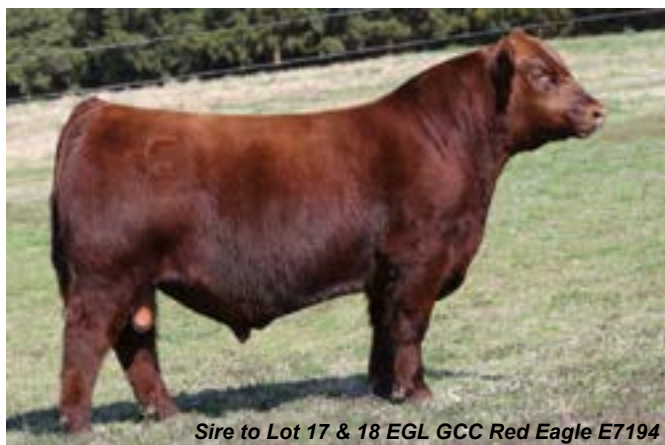
Sire to Lot 17 & 18 EGL GCC Red Eagle E7194