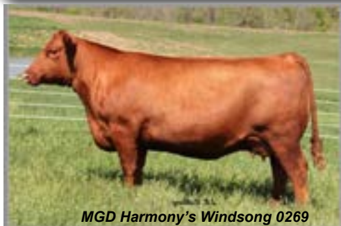
MGD Harmony's Windsong 0269

934J comes from one of 2 flushmate sisters in the VVF herd that are the result of a flush purchased from Shoal Creek, MO on the renowned 104 MPPA Windsong 0269, bred by Harmony Hills, MO back the deceased third dam 2269 owned by Majestic Meadows, MD. By studying the pictures on 0269 you'll see the outstanding eye appeal, depth of body and profile is inherent in this lineage, 934 follows that pattern and will make a fantastic cow like her predecessors. The flushmate sister to her dam as well as a full sister in blood to 934J also exhibit the same characteristics, verifying that! AI'd 12/24/22 to the popular Genex sire, Crump New Decade 9341 (4099482) PE 12/30/22 to 1/31/23, to LSF SRR EZ Factor 9056G (4110072) our resident calving ease, carcass specialist and a high selling herd bull in the Ludvigson dispersal, pictured on the IFC of this catalog. catalog then to VETO Journeyman (4526895) 1/32/23 to 3/1/23 a WFL Merlin 018A x LSF Saga bred natural born son of our signature female Feddes Lakina D6, who's a long bodied, dark red 2 year old. Resulting calf will need to be DNA sire verified depending on birthdate, ultrasound results available sale day.