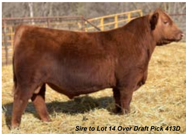
Sire to Lot 14 Over Draft Pick 413D

This January heifer is out of the cow from the 2020 Kentucky State Fair Reserve Champion Cow Calf pair. This heifer's genetic backbone comes with names that are easily recognized such as Andras Fusion and Soo Line Countess. She offers a large frame with great structure and a irresistible dark red color.